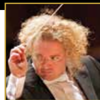
STEPHANE DENEVE Music Director Brussels Philharmonic Orchestra