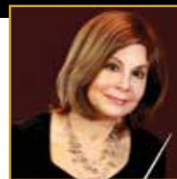
JOANN FALLETTA Conductor Buffalo Philharmonic Orchestra