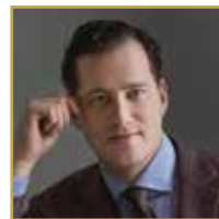
NIKOLAJ ZNAIDER Violinist Brussels Philharmonic Orchestra