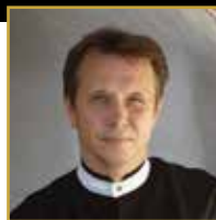
MIKHAIL PLETNEV Conductor Russian National Orchestra